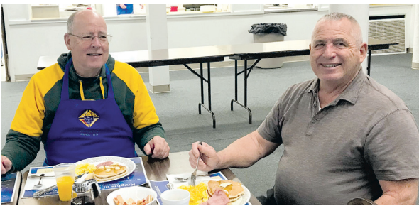
We enjoyed a wonderful breakfast on Sanctity of Human Life Sunday.

“The generous soul will be made rich, And he who waters will also be watered himself.” (Proverbs 11:25)(NKJV)